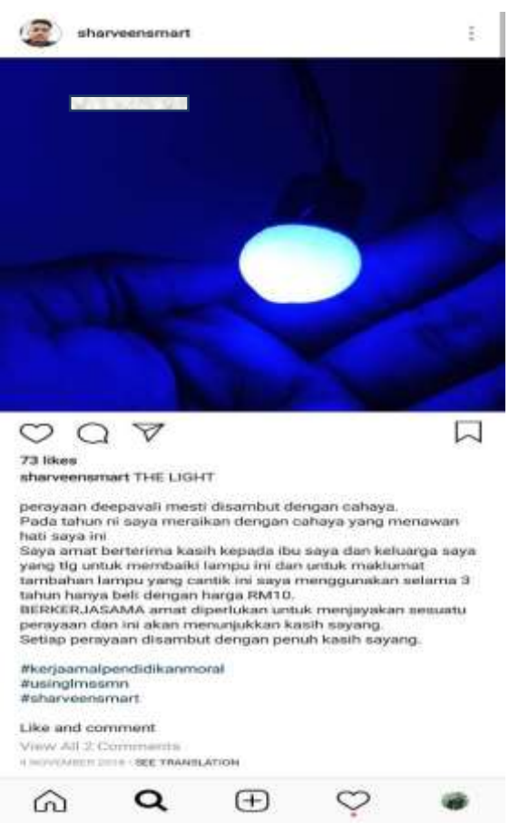
FIGURE 3: Screenshot of student posting status

In this action research, students were able to demonstrate value appreciation through proper consideration. It is basically expressed through concern, motivation and generosity. In the area of concern, proper consideration was exhibited by students on family and environmental issues. For example, students showed their concern by making the right decisions when carrying out activities with their families for the preparation of Deepavali celebration. One of the students made the decision by helping his mother repaired the damaged flashing lamps used as ornament to celebrate Deepavali (G2ADIGR4.1). The screenshot of posting status is depicted in Figure 2.