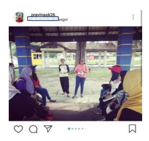
FIGURE 4: Shows poster distribution session at the beach

In addition to the fourth cycle, the students took appropriate action by raising the awareness of environmental preservation element through mural painting not only at the beach but also in school.