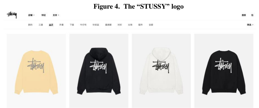
Figure 5. STUSSY online shopping website page

Valuable company logos have the power to stir up powerful feelings, as you can see from the description above. Consider the Apple logo, which already stands for creativity, superior design, and a distinctive user experience. As a result, these connections play a crucial role in how customers interact and perceive the brand.